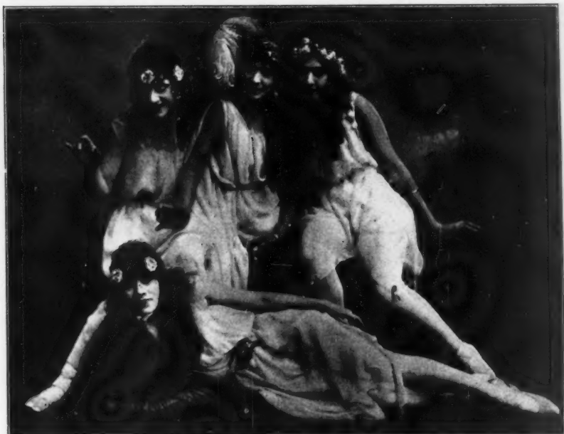
THE CAST IN "EVERY WOMAN" AT ST. LOUIS